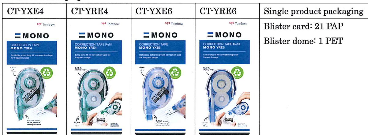
Table 2. Packaging

We hereby declare that the statement is true and correct.